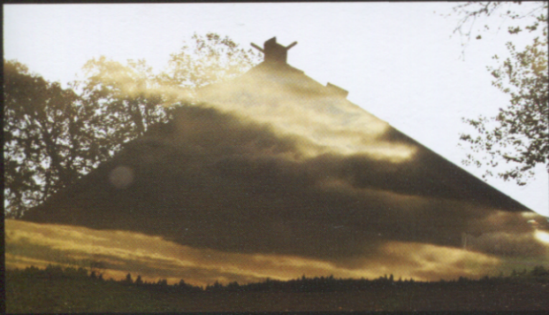
Still from Anti-Objects, or Space Without Path or Boundary (2016) by Sky Hopinka

the dancers are distorted into phantasmagoric beams of colorful light, almost mimicking the aurora borealis. Intercut with this footage is footage of Burns during one of her readings in New York City and nocturnal images of trees partially illuminated by lights of various colors. Burns talks about reincarnation and a return to the earth, while the colorful dance reflects through the light into the dark landscape. The spectacle of the dance is eliminated in favor of the movement of the people as a whole. The negative footage of the dancers creates a communal light that returns to the earth following Burns's words. The film creates a dialogue between texts from 1923, 1942, and 1945; the Burns reading from 1996; the Sacred Harp singing performance from 2012; and a Naimuma powwow performance from 2016. The wandering here is, as Hopinka explains, "a piece about reincarnation and looking at the world, and life and death; it is a way to recontextualize my tribe's beliefs, which seemed so foreign and distant to me growing up, as they do to others looking in. It's about weaving something new together." 22