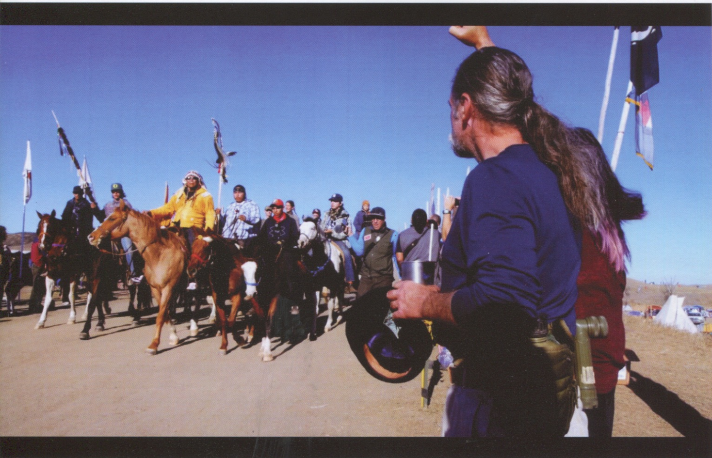
Still from Dislocation Blues (2017) by Sky Hopinka

Sea where the Aleut people were relocated from Siberia, Atka, and Unalaska by the federal government of the United States to serve as slaves to hunt fur seals. The camera wanders around the vast empty landscape while Frater's voiceover talks about the hills, the cliffs, the sea, and their names in Unangam Tunuu. The images of the hills begin to multiply and superimpose, each layer signifying their successive given names in Russian, English, and Unangam Tunuu. Frater's voice also multiplies, repeating itself while naming different local species of birds. A group of students learn the Unangam Tunuu language while the elder tries to unpack the linguistic references of the language in relation to the space of the island. Distances are measured by visual estimations between known geographical points, while numbers are also calculated visually without precision, indicating the ingrained visual embodiment of the landscape in the language. Frater also mentions the seal colonies that inhabited the island once upon a time, and invites Hopinka to hear about it. Visions of an Island's landscape infiltrates the language, and language recreates the landscape when certain sections of it no longer appear.